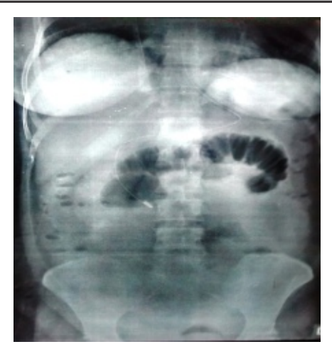
Fig. 1: X-Ray showing Multiple Air Fluid Levels

Grossly, the resected specimen of ileum measured 73 cms and showed five strictures. Cut section showed thickened firm transverse strictures with small ulcerations. Rest of the mucosa appeared normal (Fig. 2). Histological sections from the strictured area revealed superficial ulceration of mucosa. The muscularis mucosa was thinned out and the submucosa showed dense fibrocollagenous tissue (Fig. 3). There was diffuse mixed inflammatory infiltrate in the mucosa, lamina propria and sparse infiltrate in muscularis and subserosa. Few of the blood vessels showed features of vasculitis. The common causes for strictures like tuberculosis and Crohn's disease were ruled out because of the absence of any granulomatous lesions. Periodic Schiff stain, Gram's stain, Giemsa stain and Zeihl Neelson (ZN) stain were performed to rule out tuberculosis, fungi and other microorganisms. There was no evidence of villous atrophy or any viral inclusions. Thus, a diagnosis of Cryptogenic Multifocal Ulcerous Stenosing Enteritis (CMUSE) was offered.